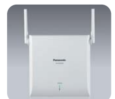
KX-NCP0158 8ch IP Cell Station