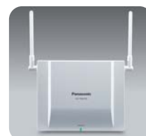
KX-TDA0158 8ch Cell Station