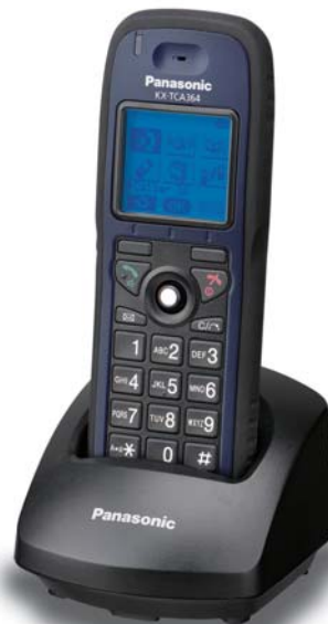
KX-TCA364 Tough Type Model