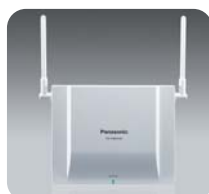
KX-TDA0156 4ch Cell Station