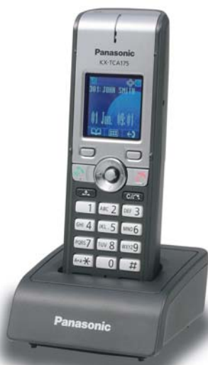
KX-TCA175 Standard Model