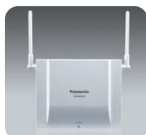
KX-TDA0155 2ch Cell Station