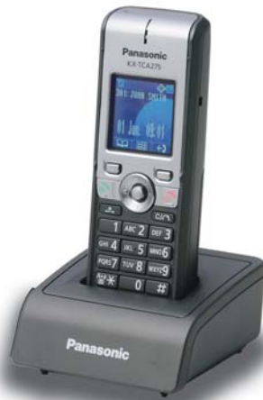
KX-TCA275 Compact Business Model