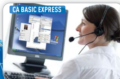
CA BASIC EXPRESS