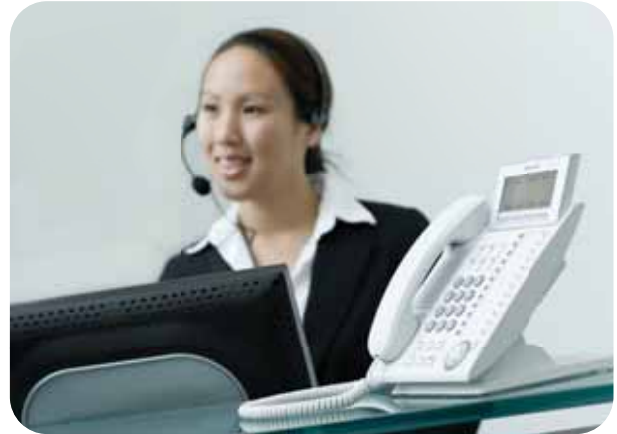
RECEPTIONIST USING COMMUNICATION ASSISTANT

Operator Console also supports the following additional options: