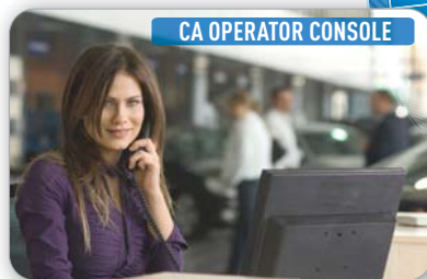
CA OPERATOR CONSOLE