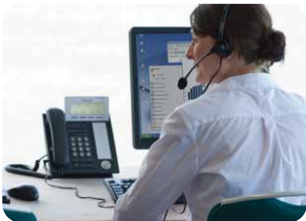
CA - PROVIDING UNIFIED COMMUNICATIONS