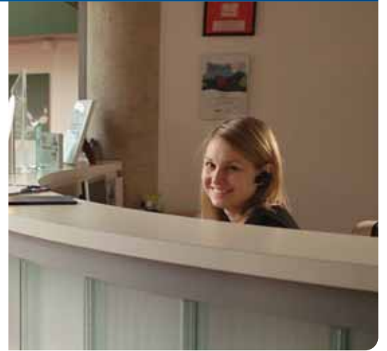
COMMUNICATIONS ASSISTANT BROCHURE